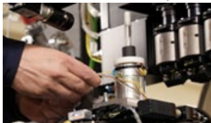
Figure 1. The sample environment under installation at ForMAX

Tomographic imaging techniques, both lab-based X-ray microtomography ( \mu CT) and Synchrotron \mu CT (SR \mu CT) offer the potential to evaluate the 3D-structure of a freeze-dried product and to follow the evolution of the matrix during freeze-drying. Capturing the dynamic events of freeze-drying in 4D requires the use of synchrotron radiation in combination with an in-situ sample environment, offering a higher photon flux, thus decreasing the acquisition time. This study utilised a novel in-house designed freeze-drying sample environment designed for \mu CT at ForMAX beamline at MAX IV Synchrotron (Fig. 1) to investigate the structure during freeze-drying of a 20% maltodextrin solution and pre-frozen pellets.